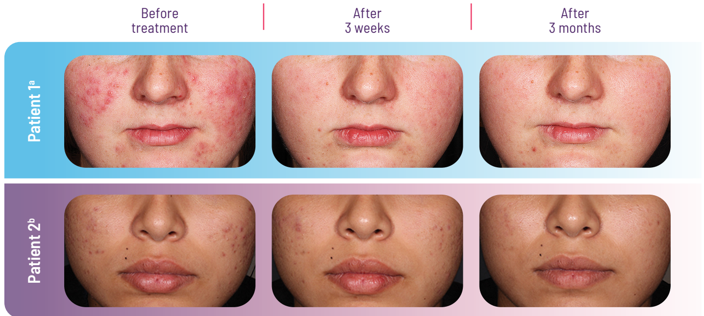
Actual clinical trial subjects. Results may vary. a Study 1 = SC1401. b Study 2 = SC1402.

In clinical trials, SEYSARA started working as early as 3 weeks after starting treatment. 1